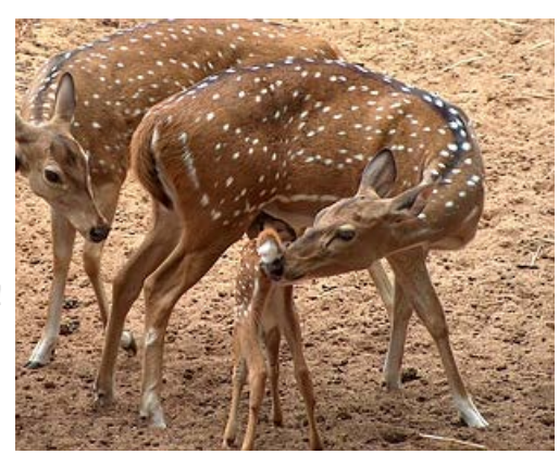
Full grown Axis deer still have spots

For more information on the Axis deer problem in Maui click here.